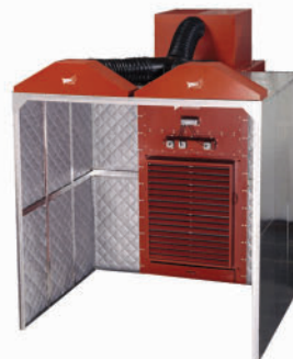
Clean Air Booths