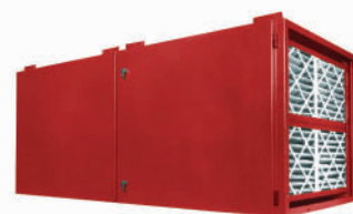
Ambient Air Cleaners